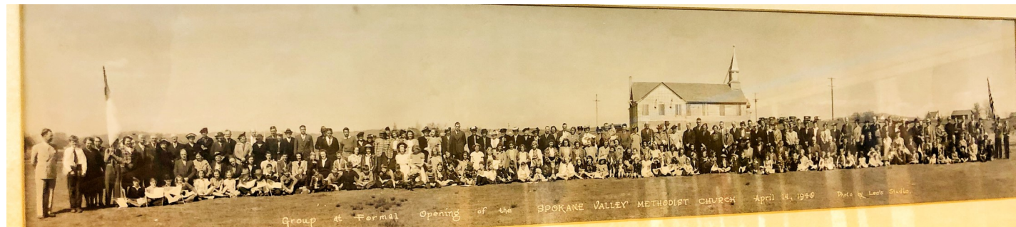
Caption Reads: “Group at Formal Opening of the Spokane Valley Methodist Church April 14, 1940”